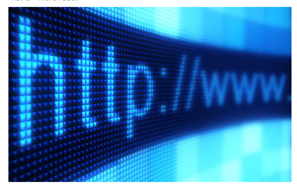
Rev 1 – March 2017

Spectrum Internet Home Broadband Services