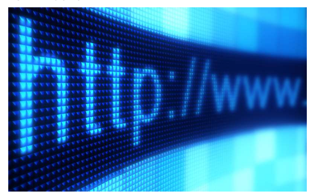
Rev 1.1 - March 2017